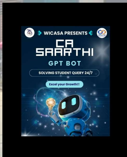
15. Dated 26 Dec 2024, Launching of CA Sarthi Chatbot