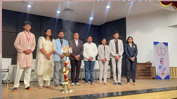
20. Dated 28 Dec 2024, Gaia Model United Nations 2024